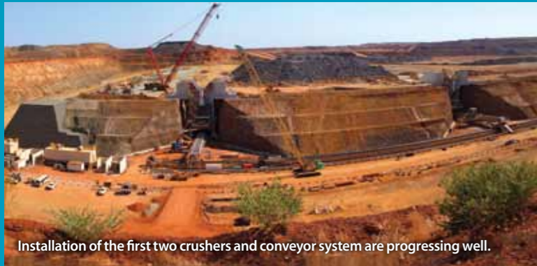
Installation of the first two crushers and conveyor system are progressing well.