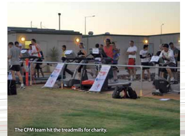
The CPM team hit the treadmills for charity.

Four treadmill teams completed 1,449 laps and two bike teams completed 2,190 laps. The effort raised approximately $7,000 for the Murdoch Children's Research Institute, with about half these funds coming from corporate sponsors.