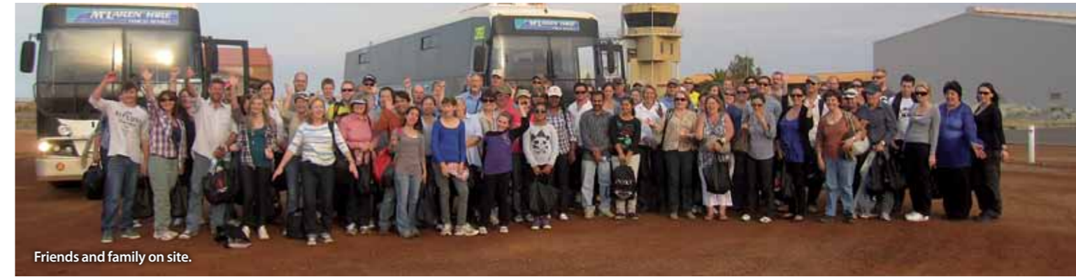
Friends and family on site.