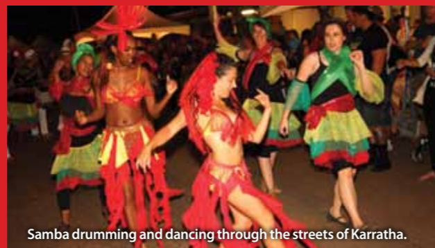
Samba drumming and dancing through the streets of Karratha.