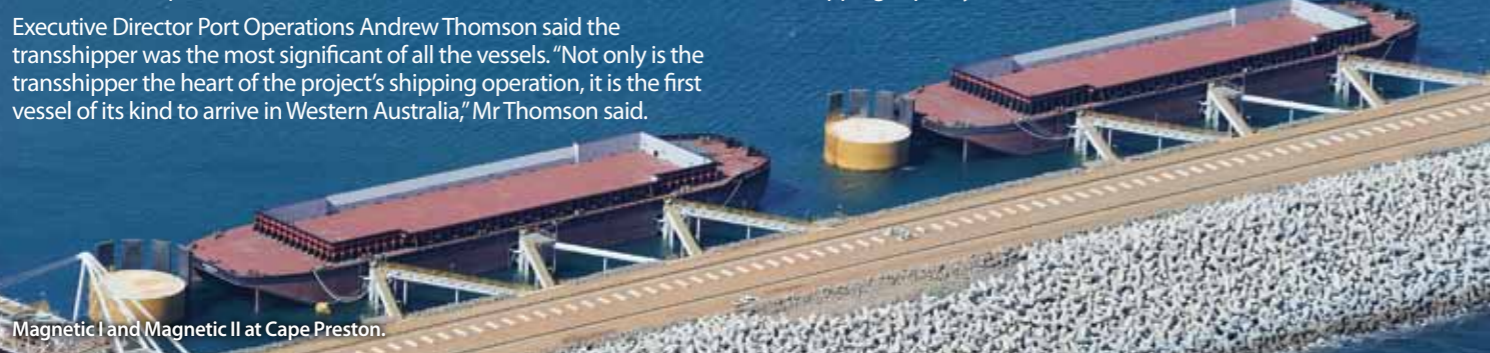
Magnetic I and Magnetic II at Cape Preston.