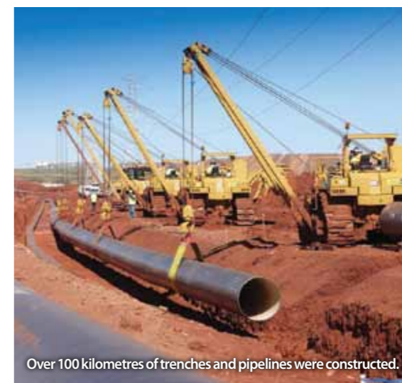
Over 100 kilometres of trenches and pipelines were constructed.